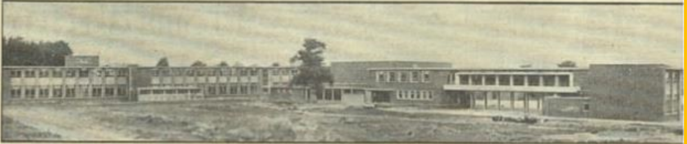
The new Rattton County Secondary School at Hampden Park. A "Gazette" photograph taken on Monday.